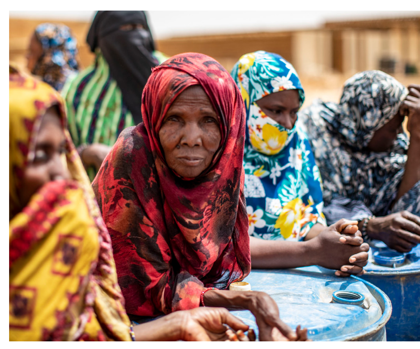
Through its Civil Affairs Division, MINUSMA financed a quick impact project (QIP) consisting of a water tower which is equipped with a solar pump and a mill for the benefit of women in the peripheral neighborhood "Sans fil" of Gao, Mali, in order to contribute to improving the living conditions of women.