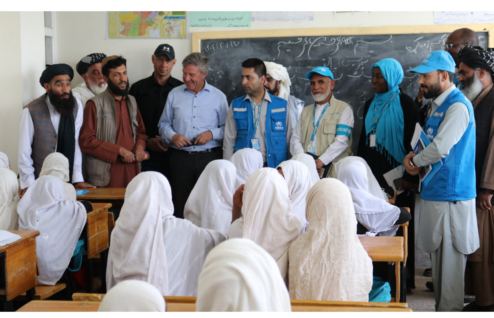
UNAMA DSRSG Markus Potzel, UNHCR and UNICEF representatives travelled to Qarabagh district of Kabul province, Afghanistan, on 8 June 2023.

These aim to generate new recommendations for advancing POC through community-based protection mechanisms and building relationships and trust between the mission and communities. However, persistent anti-MONUSCO sentiment, sometimes fomented by mis- or disinformation, or by national politicians, and repeated, sometimes deadly, attacks by armed actors against MONUSCO convoys in 2023 in Eastern DRC have made carrying out JPT missions more complicated, further damaging the relationship between the mission and communities. In the Kivus, lack of access to vulnerable populations following an extended "State of Siege" in which human rights restrictions, arbitrary detentions and insecurity increased, further soured public sentiment toward the UN. In Goma, civil society leaders and journalists refer to the mission as isolated and out of touch with reality. Despite the UN's over two decades of support to DRC's stabilisation, widespread unpopularity, largely due to a perceived failure to