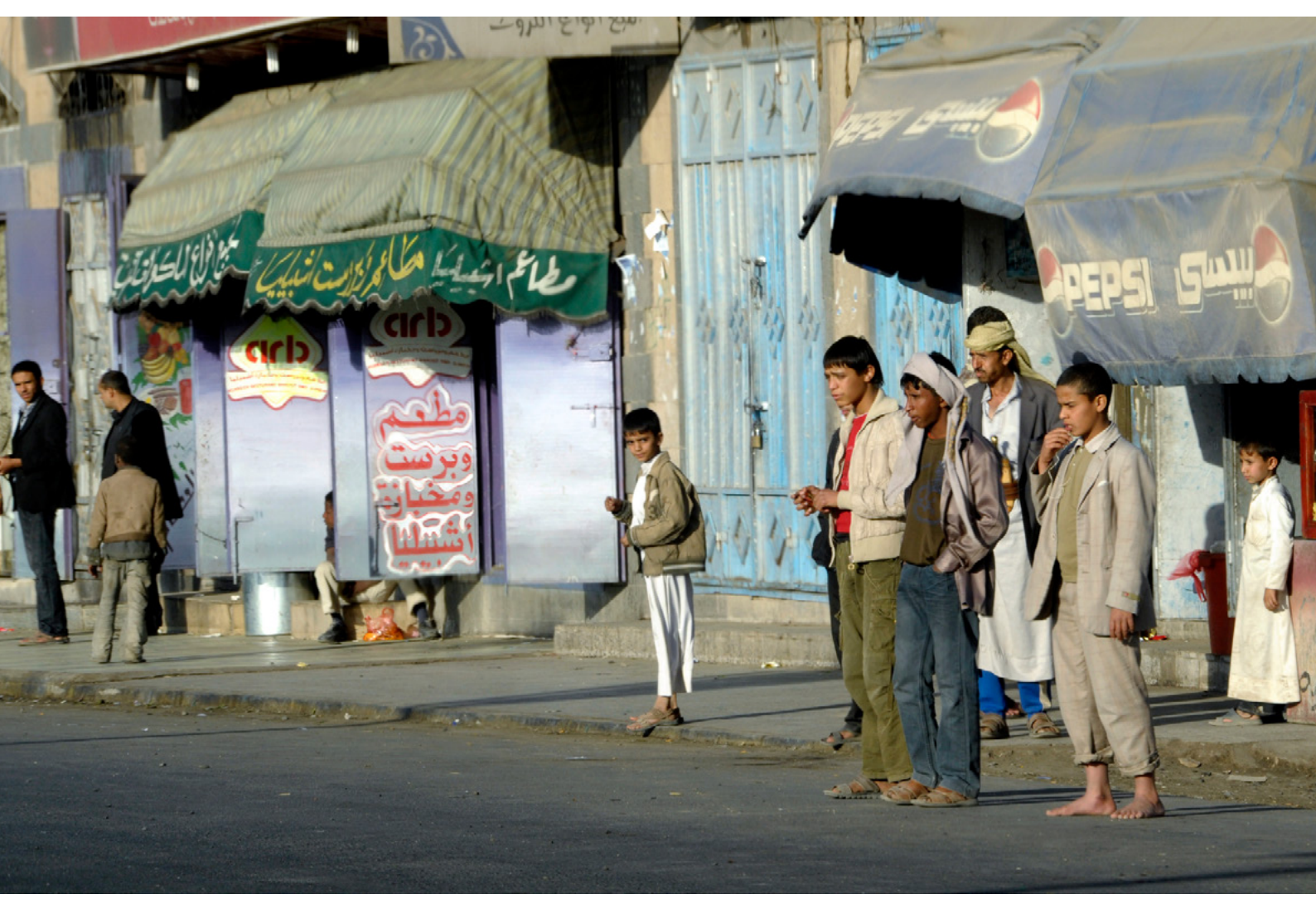
Secretary-General Ban Ki-moon visited Yemen on the eve of the first anniversary of the country's peace and transition agreement, signed on 23 November 2011 in Riyadh, Saudi Arabia. A street scene in Sana'a, Yemen.

including protecting civilians in situations of conflict. Likewise, host governments should factor in the cognate efforts of regional organisations and structures, such as military deployments with overlapping or complementary mandates or areas of responsibility, regional envoys, and liaison offices of regional bodies, to reflect the UN's supportive – rather than lead – role in many key areas addressed in this study. In this sense, and in keeping with the shared EPON methodology, claims about effectiveness relate more to contribution rather than causation.