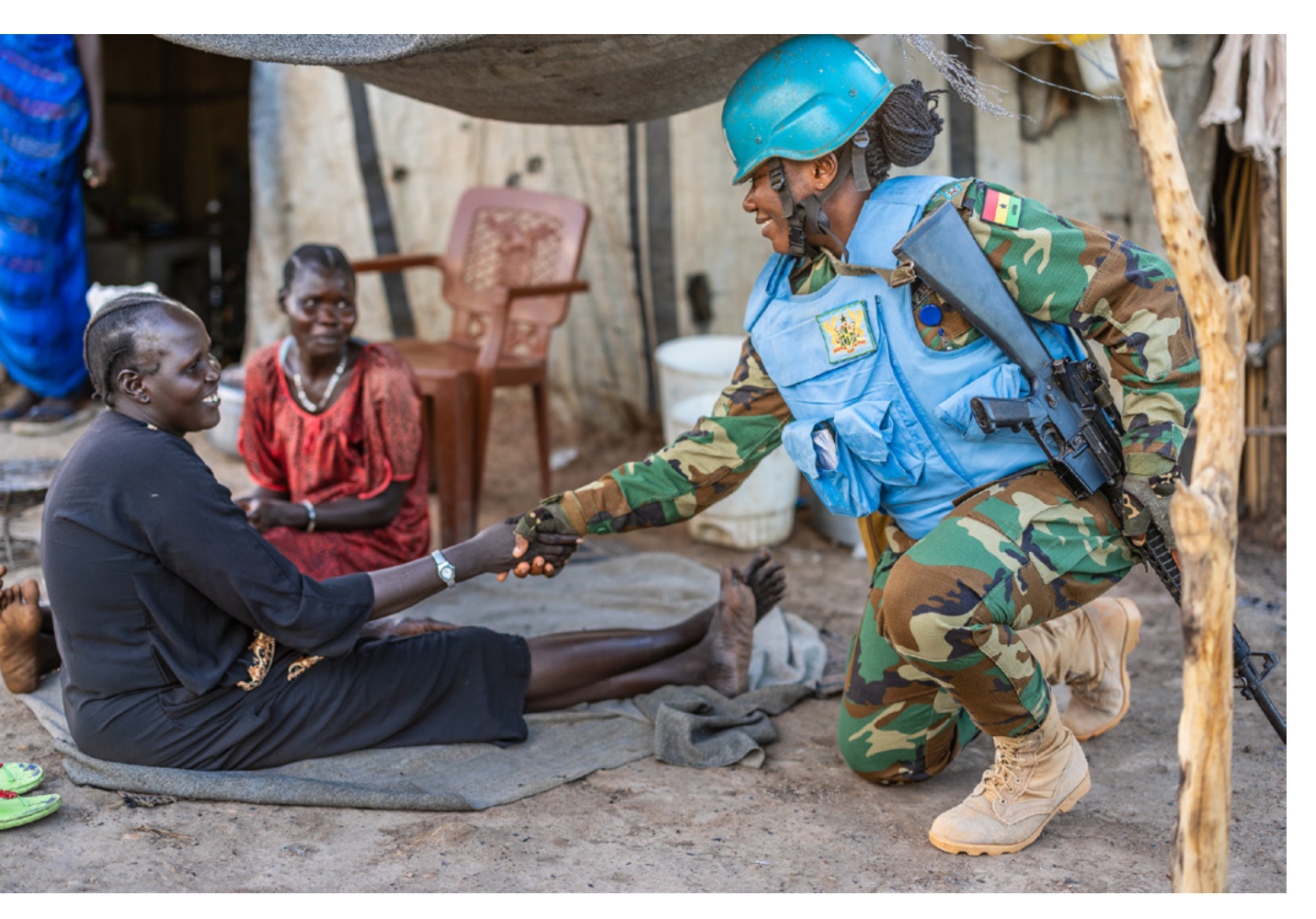
Ghanaian peacekeepers pictured during a patrol in the Internally Displaced Persons camp in Bentiu, South Sudan, on 30 October 2021.

In some settings and beyond broad mandating of human rights monitoring and reporting across missions, CSOs voiced their belief that missions were not doing enough on reporting. For instance, in South Sudan, despite positive accounts of HRD's human rights reporting, concerns emerged from communities with regards to some reports on human rights violations (HRV) which had been left unattended and had not received further investigation. Often a result of limited resources, this nevertheless has an impact on local perceptions of the human rights work, and overall credibility, of the relevant mission. Furthermore, there was a sense among some civil society actors that for political reasons, UN public reporting on human rights does not sufficiently identify perpetrators. These same actors voiced further concerns that this may make it more difficult to impose sanctions on concerned individuals.<sup>70</sup>