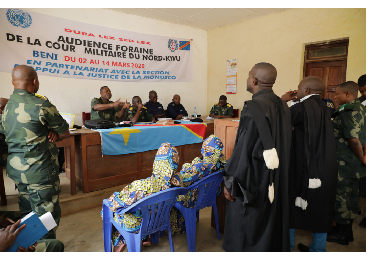
Beni, North Kivu Province, DRC. MONUSCO-facilitated military mobile court in Beni hearing about 80 FARDC, PNC and civilian members for various sexual offenses perpetrated in Beni and Butembo.

Member States to cut funding for human rights components within budgeting processes via the Fifth Committee of the UNGA are growing stronger, while many Member States are shifting emphasis toward more militarised actions. The findings of this study point in the opposite direction: if peace operations are to become more effective presences on the ground, capable of addressing both the immediate causes of violence and the deeper drivers of instability, they will need to be capacitated with robust human rights mandates and components and strong support from the broader UN architecture and Member States.