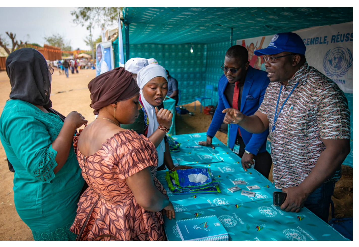
The second edition of the Ségou'Art festival took place from 31 January to 5 March 2023 on the banks of the Niger River in Ségou.

An important part of the Special Envoy good offices mandates focuses on the inclusion of women's voices in the regional peace process. The Office of the Special Envoy of the Secretary General for the Great Lakes (OSESG-GL) encourages women from civil society grassroots organisations to meet with high-profile female political leaders to discuss this challenge and find strategies to overcome structural obstacles to gender equality. However, the impact of this support to women-led peace initiatives, supported by the OSESG-GL, must be considered as part of the effective role of the UN Envoy in the peace process. As a UN senior official noted, "it is complicated for the Special Envoy as he is not invited at the heart of the political process [...] his role being on the operationalisation of the agreement". It is also worth noting that the information gathered by MONUSCO's JHRO and other human rights UN offices in the region is essential to leverage OSESG-GL good offices efforts in the region. As a UN official noted, once MONUSCO withdraws, "OSESG-GL will face challenges to follow up on the