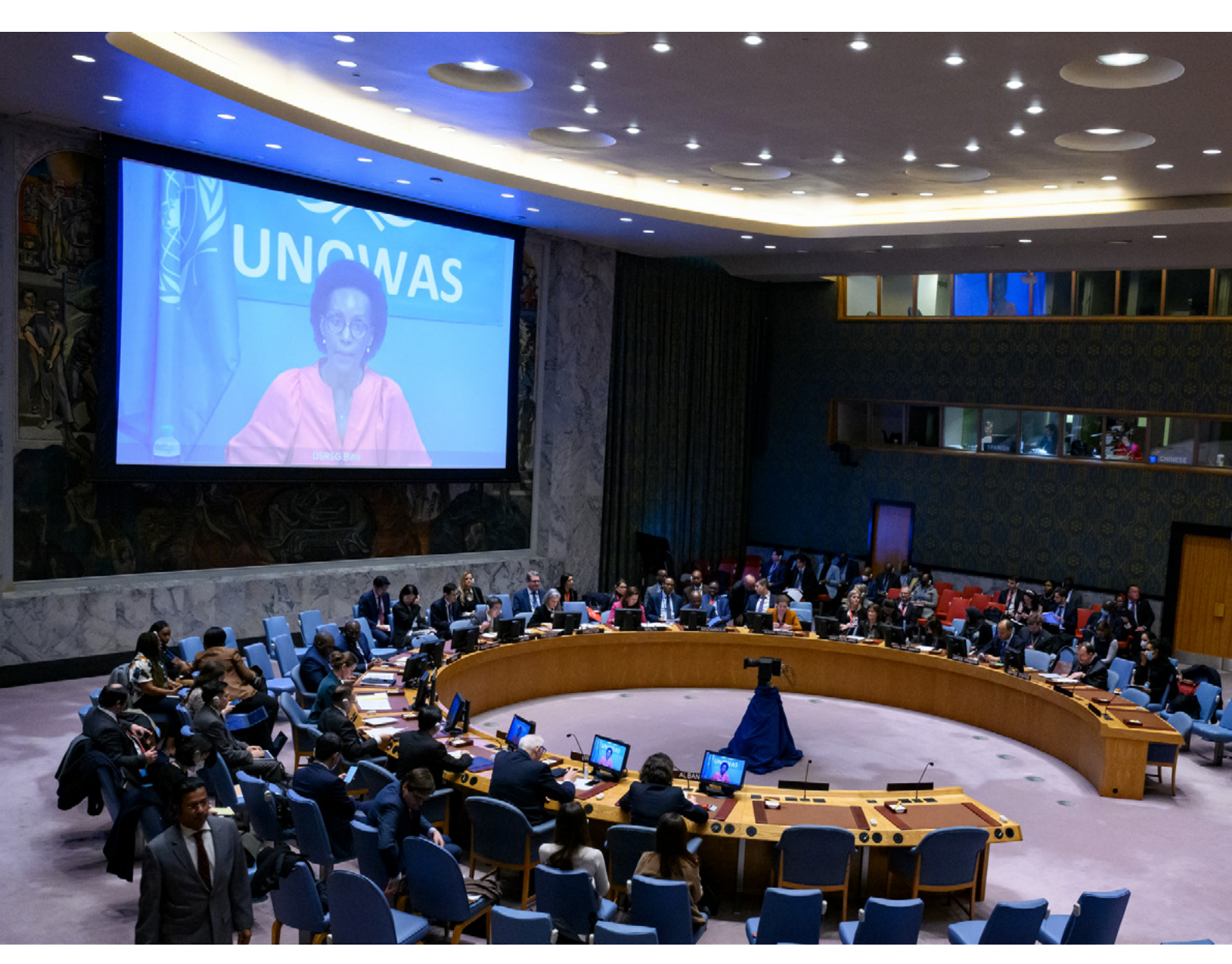
A wide view of the Security Council meeting on peace consolidation in West Africa. The Council heard a report of the Secretary–General on the activities of the United Nations Office for West Africa and the Sahel (UNOWAS). On the screen is Giovanie Biha, Deputy Special Representative for West Africa and the Sahel.