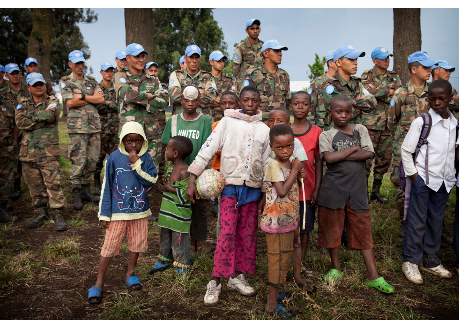
Uruguayan peacekeepers with the UN Organization Stabilization Mission in the Democratic Republic of the Congo (MONUSCO) and local youth watch a soccer game at the launching of a new soccer school at the Don Bosco centre in Goma on 24 April 2014.

rights and freedoms protected under IHL provide a clear avenue for HR norms and principles to be promoted. Focusing on IHL has also enabled OSESGY's work on SSR to improve protections for civilian populations.<sup>264</sup>