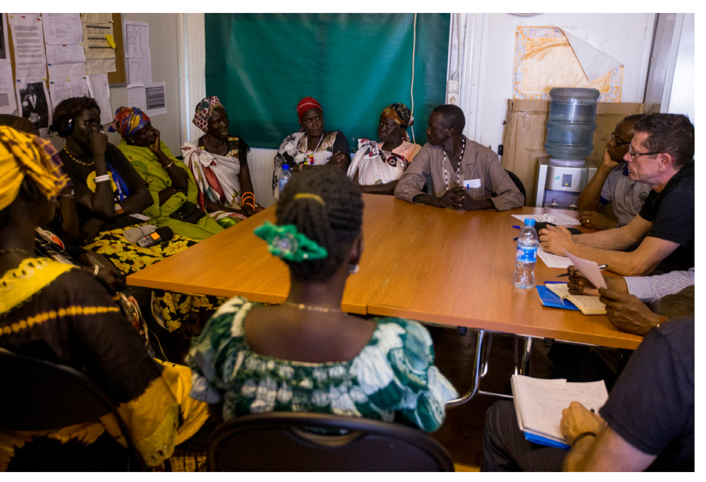
Ivan Šimonovic (right), United Nations Assistant Secretary–General for Human Rights, meets with internally displaced women from the Protection of Civilians Camp (POC) in Malakal, South Sudan.

In addition, MONUSCO's presence has, in some instances, broadened civic space, deterring potential human rights violations. A civil society representative shared an interaction highlighting MONUSCO's role as a deterrent to oppressive actions by local authorities.<sup>389</sup> However, it is worth noting different perceptions regarding the mission's impact. While some view MONUSCO as integral to the protection of civic space and journalistic freedoms, others believe that its eventual departure may not significantly impact freedom of expression within the DRC.<sup>390</sup>